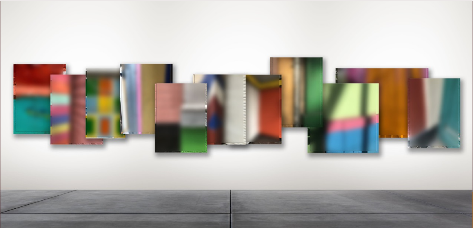
rendering of proposed project

The idea I am interested in delving into is a unique exploration of color within the context of Mexican culture, particularly with regards to architecture and even more specifically with individual homes and neighborhoods in Mexico. Over the years, I have been documenting the lively juxtapositions of colors and hues chosen by individuals and how they connect and/or clash brilliantly with neighboring homes. These photos act as abstract expressions of the dwellers' character and culture. The images are to be printed on aluminum to establish a permanence, and to further abstract the element of color, have sheets of frosted glass to blur out the details of the photos. This body of work acts to legitimize a fearless yet unconscious inheritance of color and unique spirit I am referring to as "Mexican Color Theory." This work resonates with me as an extension of my cultural identity and acts as a way for me to amplify a positivity around it. This project dovetails perfectly with an ongoing series of projects exploring cultural themes in my work, specifically created as I travel through Mexico.