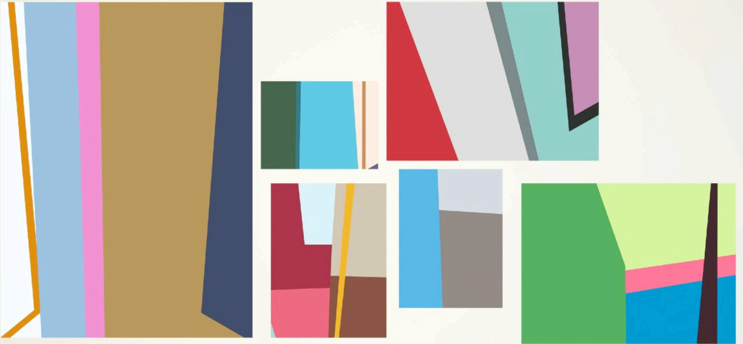
other treatments presented as collage pulling colors/ layout from photos, digitally abstracted