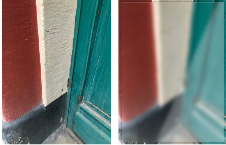
example of original photos focusing on the color relationships before blurring by placing frosted glass in front of image